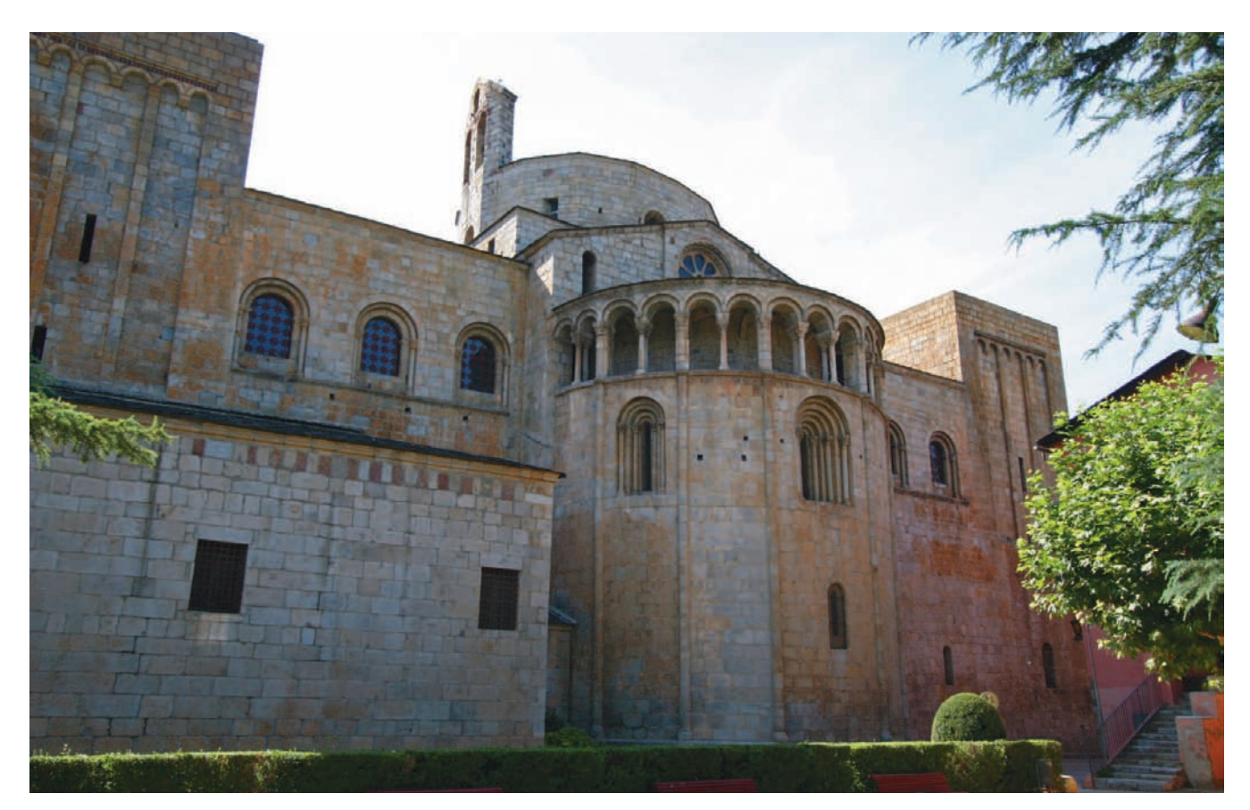
Figure 7. Exterior of the chevet of the cathedral of La Seu d'Urgell.

In terms of its floor plan, the cathedral in La Seu d'Urgell seems to be laid out based on prototypes of the monumental Romanesque church. It has a basilica layout with three naves crossed by a large transept, like the ones found in Sant Miquel de Cuixà and in Santa Maria of Ripoll, and a chevet made of five semicircular apses. The crosssing, which was supposed to be finished with towers on either side that were ultimately never built, has such thick walls that the side apses are embedded within them. As result, thanks to the importance of the presbytery, the central apse stands out and takes prominence. The central