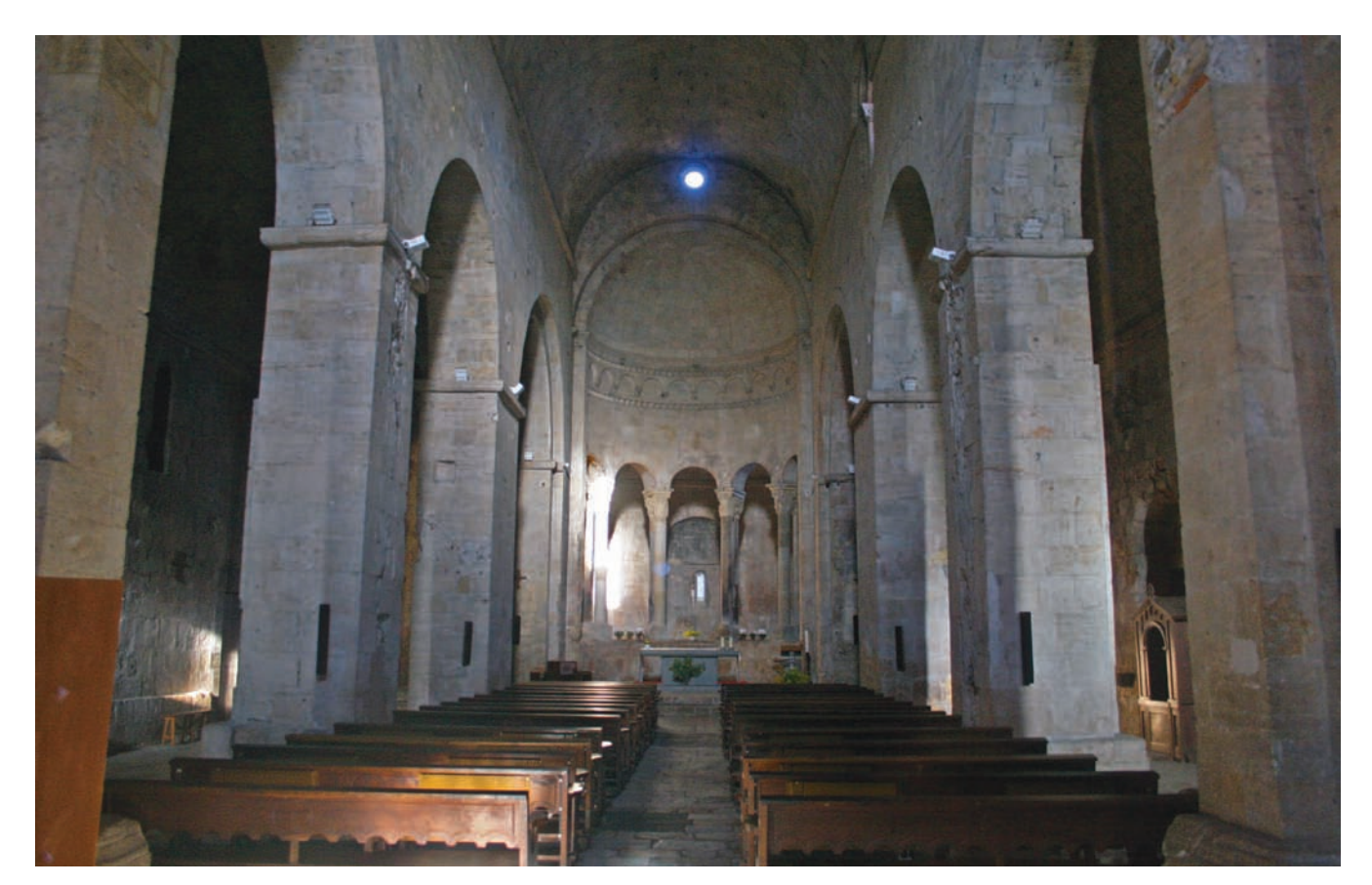
Figure 8. Interior of Sant Pere of Besalú, showing the deambulatory of the chevet.

Logically, the construction reform was propagated in the countships closest to Roussillon, including Besalú, Empúries and Girona. There, the basilica structure, mainly with a single nave either with or without a transept, received a new impetus. In the bishopric of Urgell, the old churches had practically not been reformed since the 10th century, so the renovation movement gained special momentum there. The most emblematic project was the construction of the new cathedral, which adopted the well-known forms of the basilica layout with a single nave, transept and rather simple chevet. This typology also reached the Vall de Boí region, even though some structures still retained their wooden sloped roof held up by columns, most likely due to a simple lack of resources to finance the high cost of a stone vault. The tradition of the early Romanesque continued in the inland regions of Catalonia with the addition of new elements like the early attempts at a pointed vault, a more prominent presence of sculptural decorations and the use of columns either attached to pillars and apses or flanking the doorways. The monumentality of the early Romanesque was enhanced by the decorative component and the profusion of sculpture, works by artists with close ties to Roussillon which could also be seen in the sculpture of Toulouse.