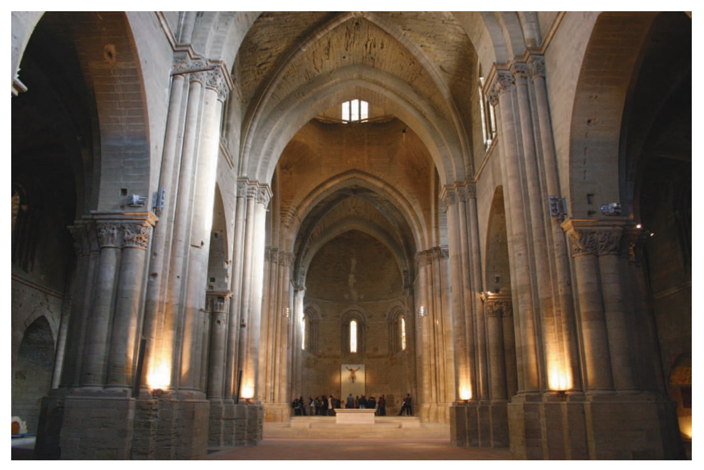
Figure 9. Interior of the Seu Vella (old cathedral) of Lleida.

Among the new developments contributed by French architecture we can mention not only the more decorative appearance of the sculptures but also the apsidioles embedded inside the thick walls. Churches like the new cathedral in La Seu d'Urgell and Sant Pere of Besalú are good examples of this influence.