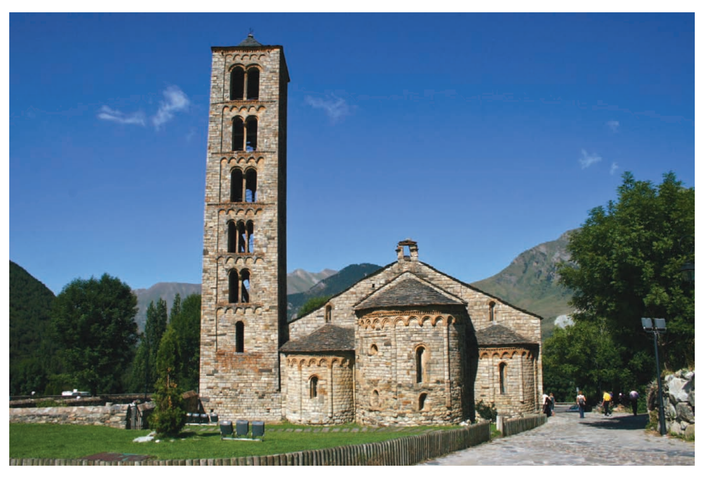
Figure 1. Romanesque church of Sant Climent de Taüll. It shows a basilica layout with three naves, an apse and two apsidioles, plus a tower on the southern facade facing east very close to the apse. The belfry is square and freestanding, although it is built very close to the bulk of the building on the corner of the southern wall next to the chevet.

Romanesque drew. This re-encounter with the national origins associated with the Romantic movement and experienced in every European state led to greater knowledge of the past, the study of this past and systematic campaigns to conserve remnants of the Middle Ages.<sup>6</sup>