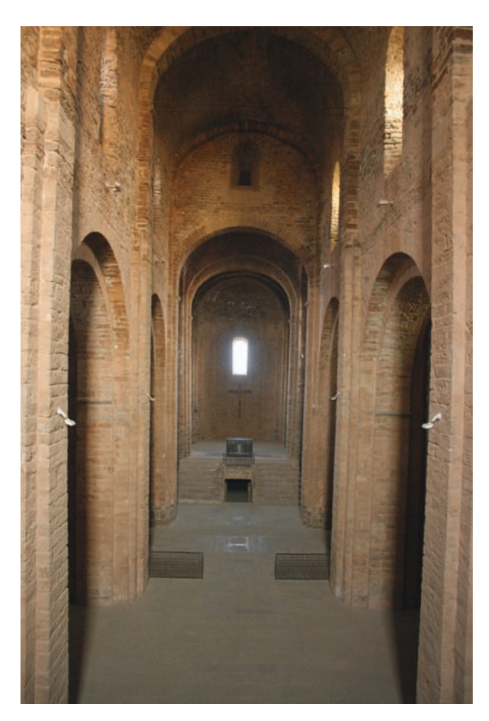
Figure 6. Interior of the central nave of Sant Vicenç de Cardona.

outside volumes. Certainly, if the indoor space is finely wrought in terms of the amount of light and the structure of the different architectural elements, outside the volumes are what truly draw the eye. An element like the transept, which is practically concealed at ground level, takes on a great deal of strength in the building's outer shape, clearly marking the Latin cross of the floor plan. The outside is not only a faithful transcription of the liturgical space inside; rather it very clearly conveys the Romanesque masters' concern with the building's structural balance by resting the vaults atop each other.